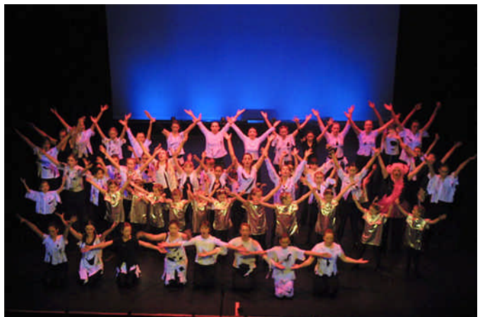
Children of the Lost Planet

Get your photos now at www.katemallender.co.uk