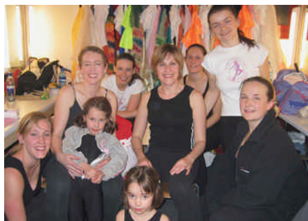
Senior girls' dressing room (with added extras) at the Opera House, 2006

Odyssey - New Year 2007 – Grand Opera House, York