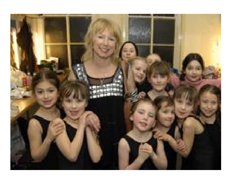
Backstage at the Grand Opera House, York