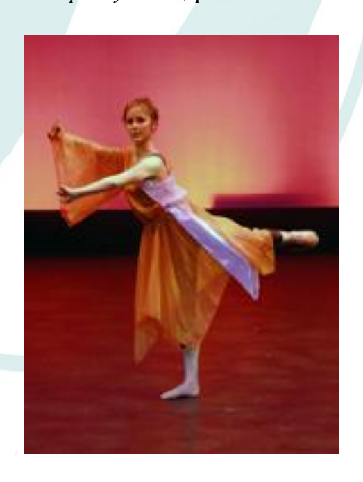
The Music Box ~ 2008

View all the fabulous show photographs at <u>www.photoboxgallery.com/katemallenderphotography</u>