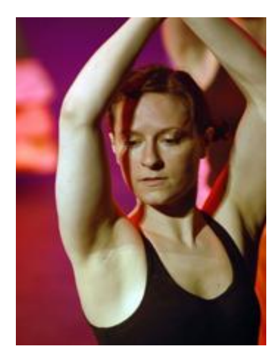
The Music Box

"When we take up a mask to dance in, use in ritual, to work magic with, we transform ourselves. Magical masks are not there to hide ourselves from our embarrassment or to conceal ourselves for villainy but to offer a face to a character waiting "over there" to come "over here" and act."