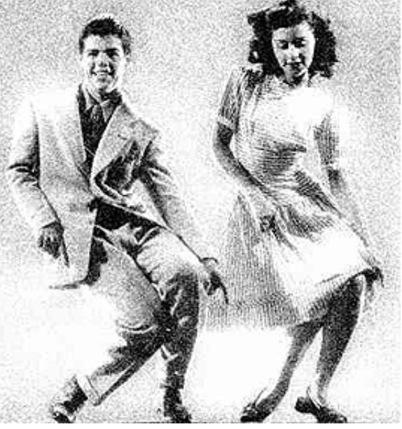
Particularly "hep" cats...

Though they technically preceded the rise of swing music, and are commonly associated with Dixieland jazz which developed in New Orleans in the south of the United States, dances such as the black bottom, charleston, and tap are still considered members of the swing dance family.