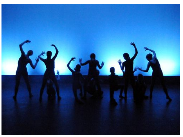
To view and order photos from our 2010 show Urban Jungle , please visit Kate Mallender's website and enter the password yorkshire2