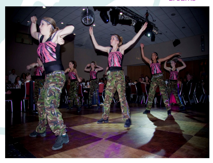
YSDD dance group at Dance Against Hunger ball

"Tread softly because you tread on my dreams"